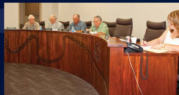
The Board of Commissioners adjourns its first meeting in the new Board Room.

In 2009 St. Bernard Port completed more than $30 million in improvements generating badly needed construction jobs for the local economy. Projects include a transit shed, a lumber processing