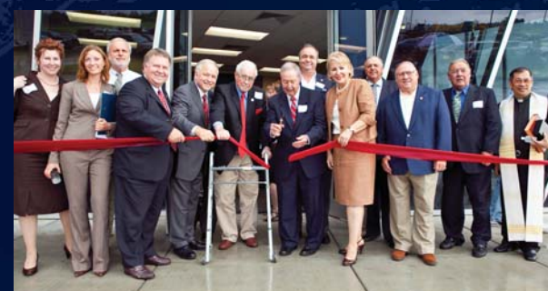
Ribbon cutting ceremony for the dedication of the