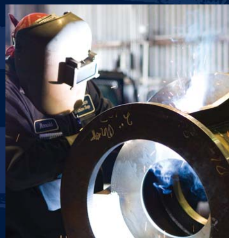
As the Port grows, job opportunities increase for related business-