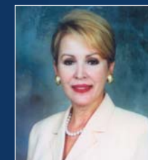
Rep. Nita Hutter