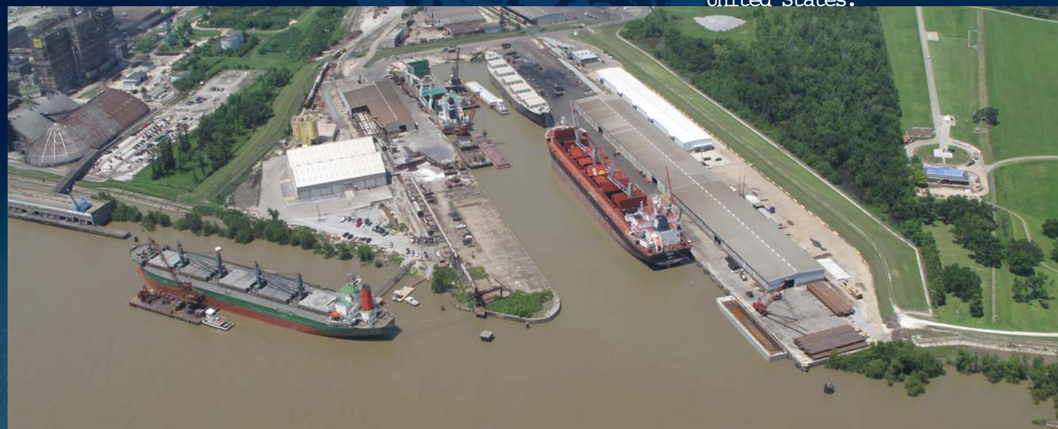
The Port features the only deep draft, calm water slip on the lower Mississippi River.

St. Bernard Port's jurisdiction is strategically situated on the busiest shipping corridor in the world, the Mississippi River. America's industries depend upon the goods and materials that are vital to manufacturing being transported via this waterway. Metallic ores, minerals, ferro alloys, petroleum and metallurgic coke, zinc concentrates, aluminum, steel, copper and wood products are all handled at the Port's Terminals.