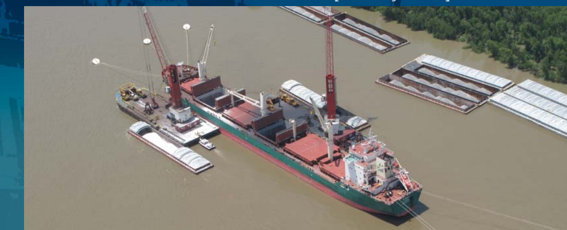
Cargo being trans-loaded at one of the Port's four midstream mooring systems.