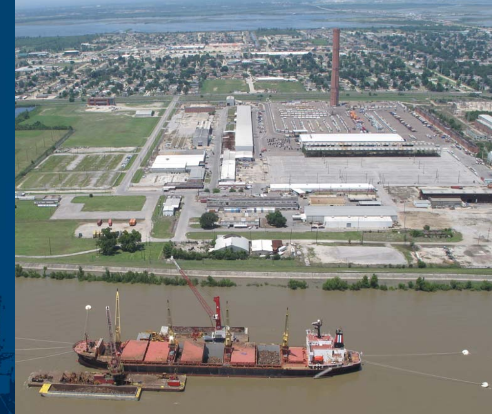
The 216-acre Chalmette Terminal includes the Boasso America intermodal

Ocean-going vessels from around the world arrive at the Chalmette Slip carrying these cargos that are then transferred to barges, railcars and/or trucks for delivery to industrial plants throughout the nation. These destinations are as far north as St. Paul, Indianapolis, Chicago and Pittsburgh. Cargo is also transported to Missouri, Tennessee, Kentucky, Arkansas and states throughout the southeastern United States.