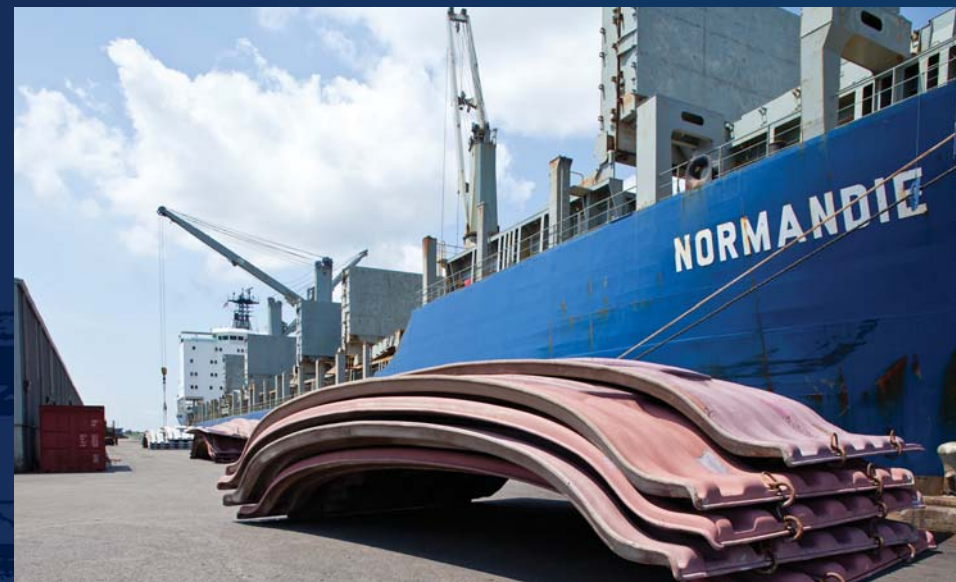
The Rehabilitation of Berth D at Dock 2 increased the load-bearing capacity allowing for greater tonnages of cargo handling.