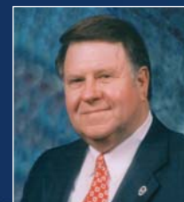
Sen. A.G. Crowe