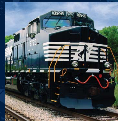
The Port is served by Norfolk Southern with direct connections to