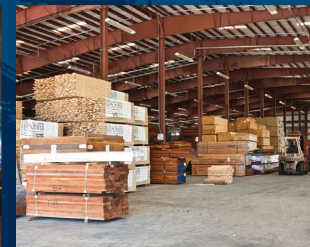
The Port's longest tenure business, Robinson Lumber, was relocated to a new 72,000 square foot lumber processing facility at the Arabi Terminal.