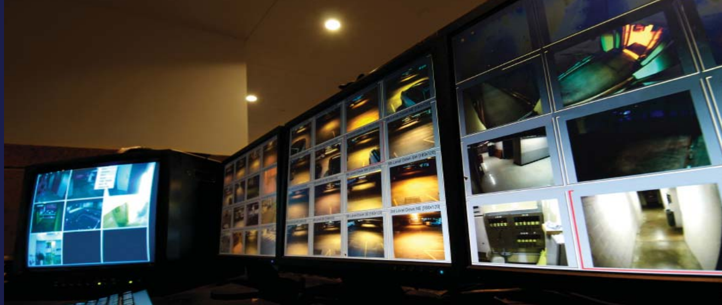
Security is priority one at the Port. The new Maritime Security Operations Center will be equipped